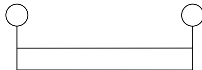
Figure 2: Separate feeding of two tracks.