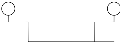
Figure 3: Artificial increase in feeder length.

It is also possible to have one railway substation placed at a distance with a feeder length of several kilometres, while the other one is placed directly on a railway. This leads to the currents of the substation with a shorter feeder length to be always greater than the currents of the substation with a longer feeder. In order to compensate the currents it is possible to artificially increase the length of a feeder on the substation which is “too close” to the railway (Figure 3).